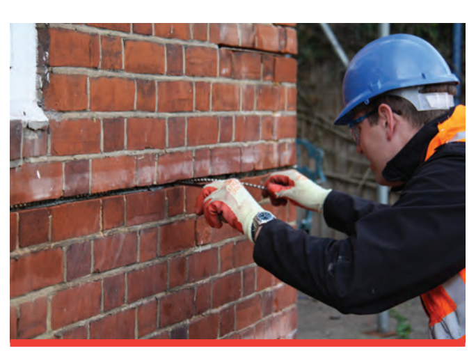
HeliBar is inserted into HeliBond grout within a cut slot