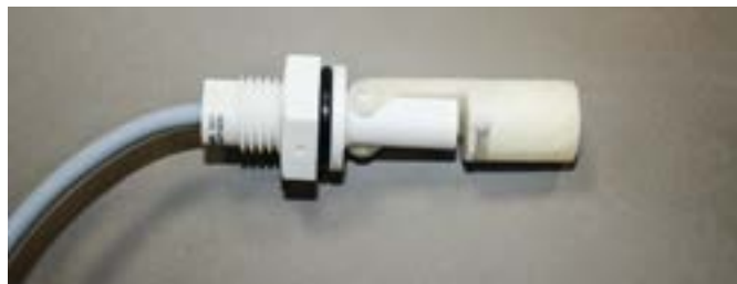
Float Switch Closed