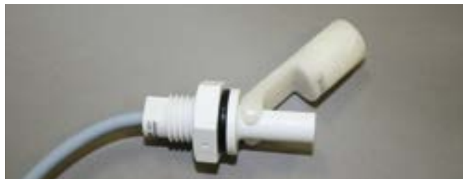
Float Switch Open

The "Power ON" LED light on the front panel of the alarm will illuminate immediately.